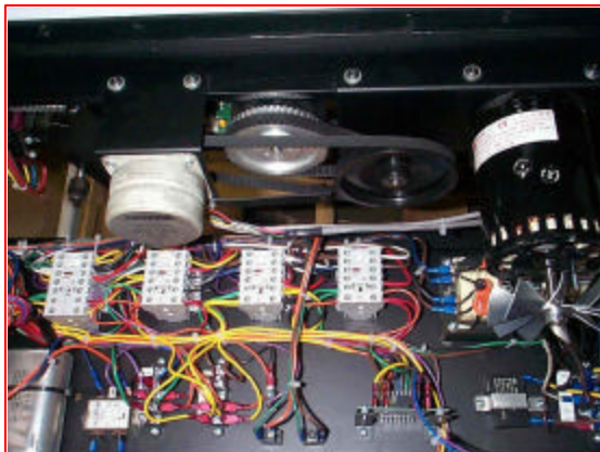
Powerline electrical system, front deck removed